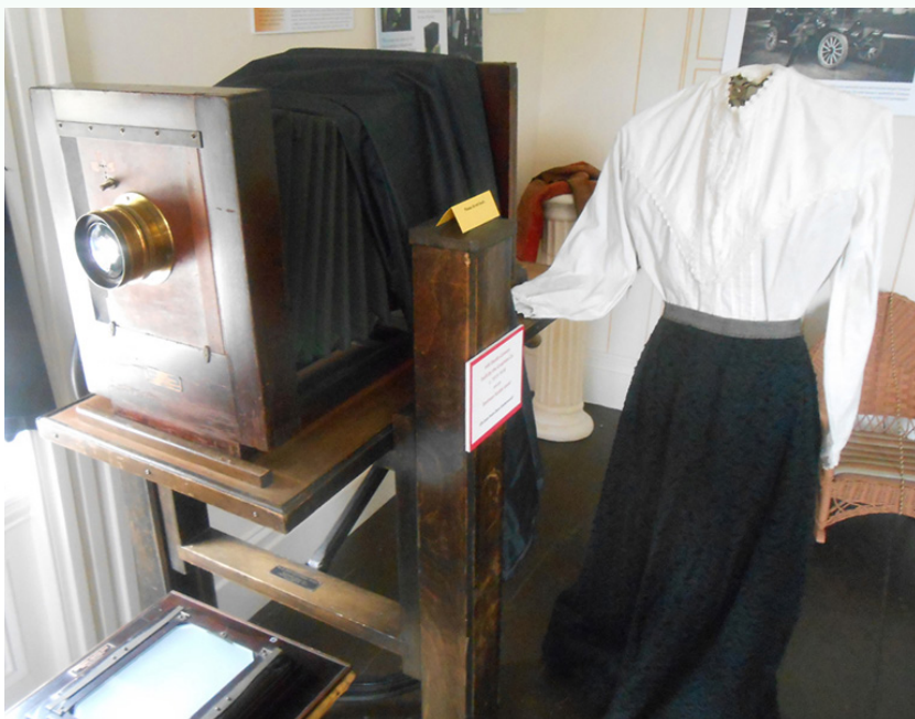
exhibit "Capturing Washtenaw County – The Art and Business of Early Photography" opened in May and has been popular with our visitors. We invite you to come see it during the summer and fall months. The Museum is open Saturdays and Sundays, from 12-4 PM and weekdays by appointment. Groups are welcome, call 734-662-9092 or email wchs-500@ameritech.net so we can accommodate your needs.

Now, at any and every opportunity, life's events are documented with smart phones, cameras and other digital devices. But at one time in our history, major life events were commemorated in the photographer's studio. Births, confirmations, graduations, team membership, army enlistments, marriages and more, were captured and produced by professional photographers at one of the many the local studios. The current