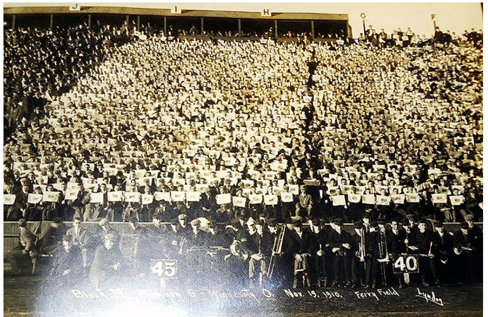
Lyndon photo of Block M at Minnesota game, Ferry Field, Nov. 19, 1910

Lyndon travelled all over Michigan taking photographs, many of which