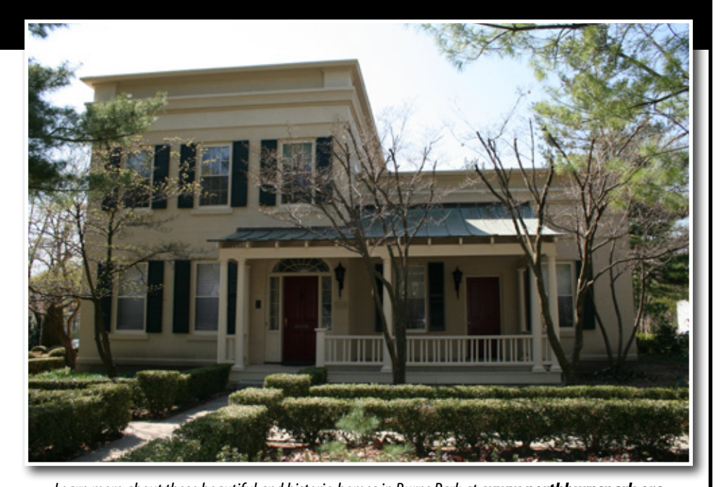
Learn more about these beautiful and historic homes in Burns Park at www.northburnspark.org