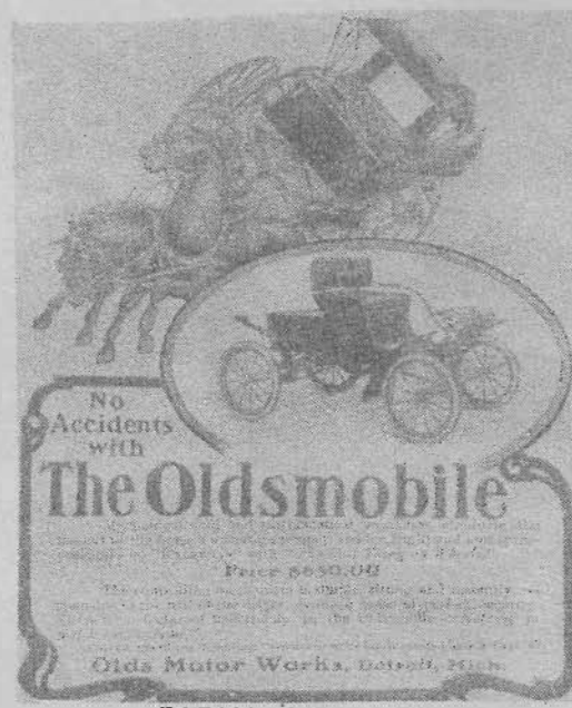
EARLY OLDS, $650

"A few years earlier we had sent many of our young men off to the Civil War. They trained at Detroit's Fort Wayne. Years later in 1891 they returned when the GAR held a great meeting in Detroit. They